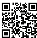
Sample Test Report